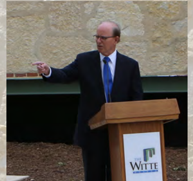
Judge Nelson Wolff addresses the crowd