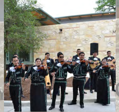
Southwest High School Mariachi Band performs for the large crowd