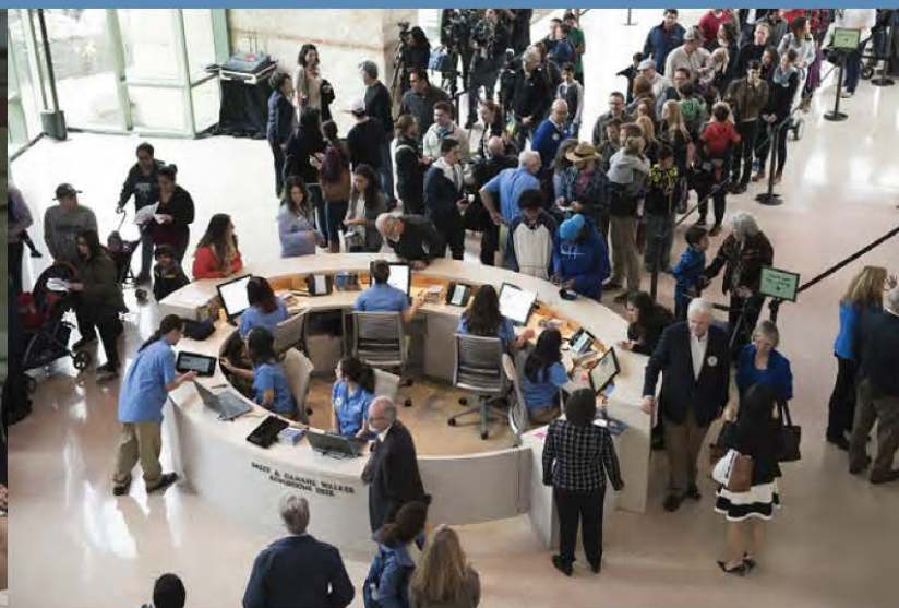
First guests of the New Witte stand in line to enter the museum